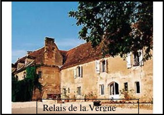
Relais de la Vergne